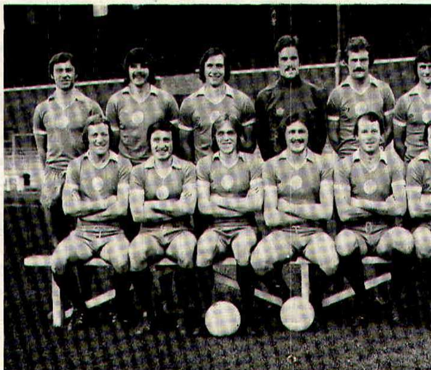
Back Row (left to right)